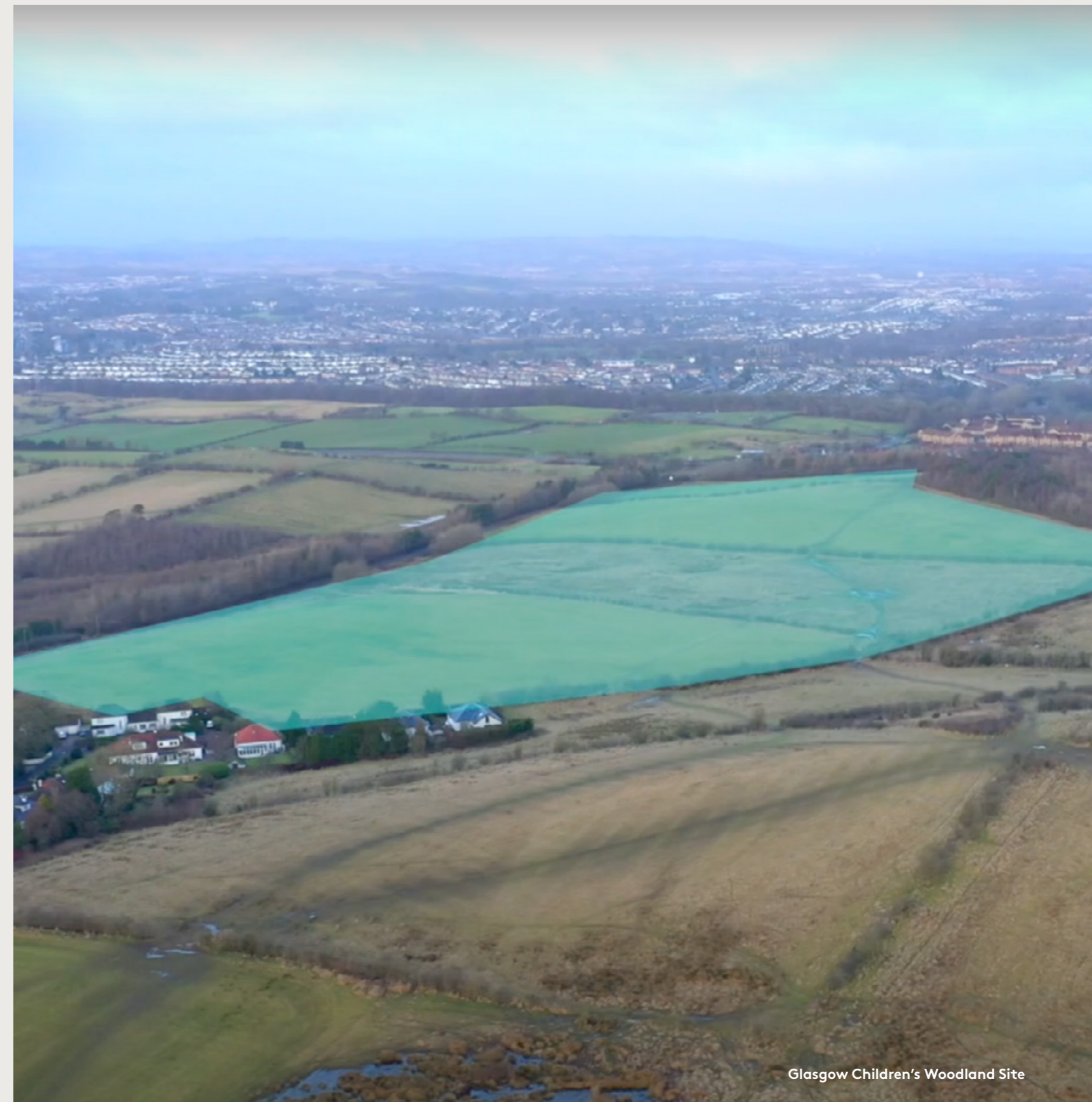
Glasgow Children's Woodland Site

Write a poem or story about a tree or make an eco-friendly decoration for a tree. Go on a bug hunt around your tree and see what you can find. Do you think you'll find more bugs in winter or summer? Examine and compare leaves on different trees. Draw them. Perhaps, you could even plant a tree to care for and enjoy.