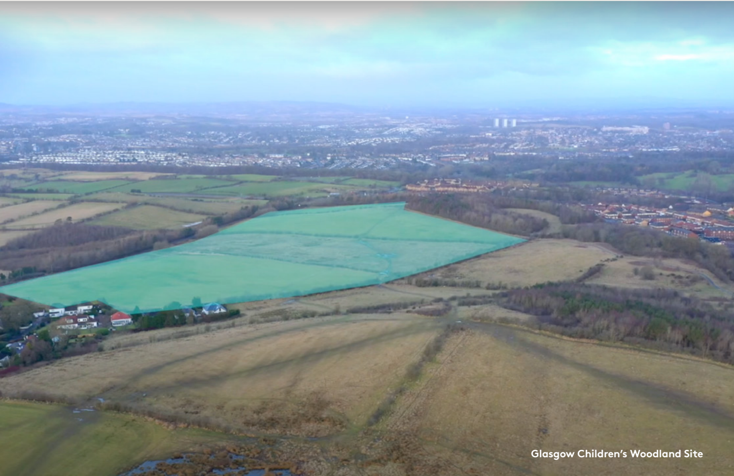
Glasgow Children’s Woodland Site

We will bring your messages and images of a greener, fairer future to COP26. @The_Lost_Woods_ #MyTreeOurFuture #GreenerFairerFuture